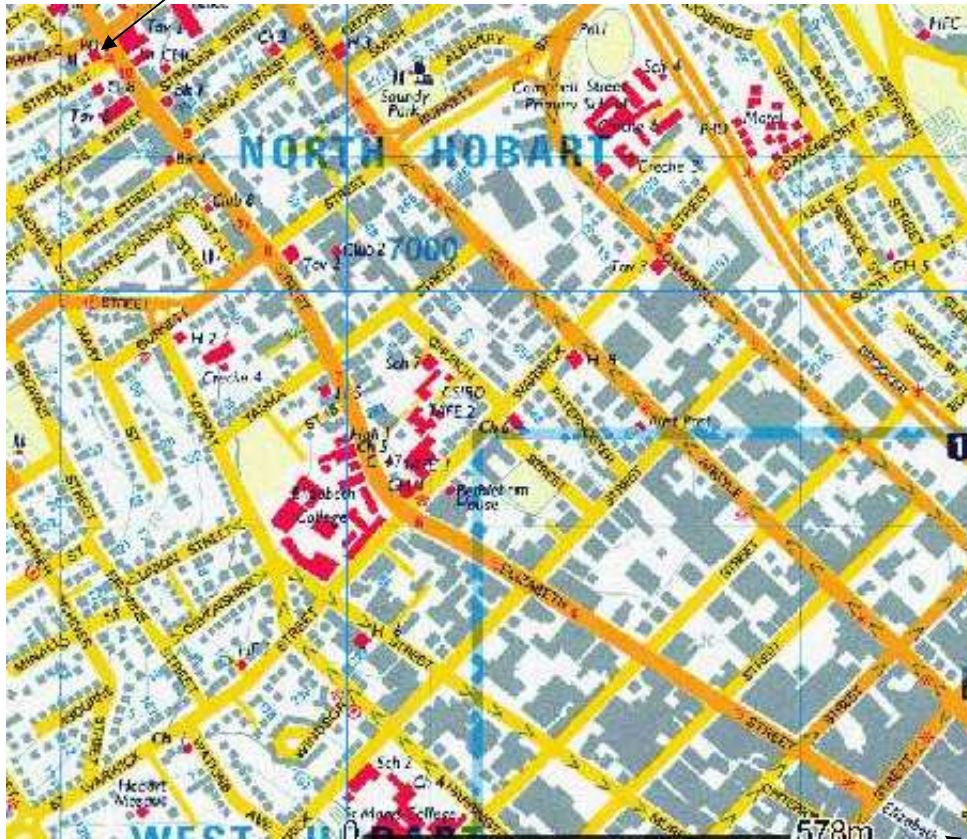
North Hobart post office